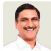
SRI T. HARISH RAO President